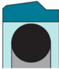
Seal Profile: DK125

Submit completed form by email to sales@daemarinc.com or by fax to 905.847.6943