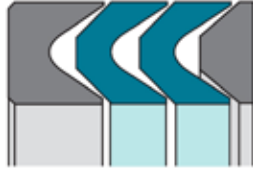
Seal Profile: DS127

Submit completed form by email to sales@daemarinc.com or by fax to 905.847.6943