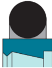
Seal Profile: DS109

Submit completed form by email to sales@daemarinc.com or by fax to 905.847.6943