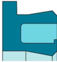
Seal Profile: DR119

Submit completed form by email to sales@daemarinc.com or by fax to 905.847.6943