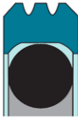
Seal Profile: DR116

Submit completed form by email to sales@daemarinc.com or by fax to 905.847.6943