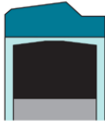
Seal Profile: DK238

Submit completed form by email to sales@daemarinc.com or by fax to 905.847.6943