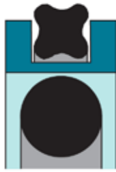
Seal Profile: DK145

Submit completed form by email to sales@daemarinc.com or by fax to 905.847.6943