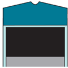
Seal Profile: DK143

Submit completed form by email to sales@daemarinc.com or by fax to 905.847.6943