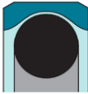
Seal Profile: DK142

Submit completed form by email to sales@daemarinc.com or by fax to 905.847.6943