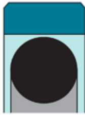
Seal Profile: DK108

Submit completed form by email to sales@daemarinc.com or by fax to 905.847.6943