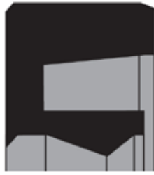
Seal Profile: DR207

Submit completed form by email to sales@daemarinc.com or by fax to 905.847.6943