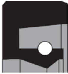
Seal Profile: DR204

Submit completed form by email to sales@daemarinc.com or by fax to 905.847.6943