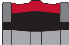
Seal Profile: DK222A

Submit completed form by email to sales@daemarinc.com or by fax to 905.847.6943