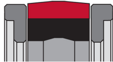
Seal Profile: DK109

Submit completed form by email to sales@daemarinc.com or by fax to 905.847.6943