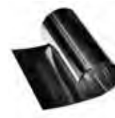
Shim Rolls & Sheet