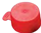
Caps & Plugs