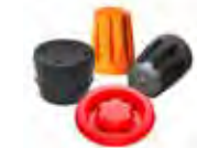
Oilfield Thread Protection