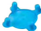
Pipe & Flange