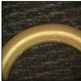
Kalrez® 9100 Top Nozzle Seal