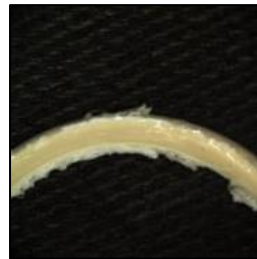
Incumbent FFKM Poppet Seal