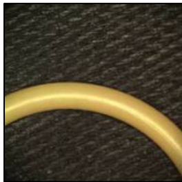
Kalrez® 9100 Poppet Seal

Figure 2. Kalrez® 9100 and incumbent seals after processing 5000 wafers. It was the research center's opinion that the Kalrez® 9100 seals could have continued to function beyond the scheduled PM cycle of 5,000 wafers.