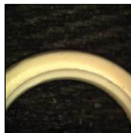
Incumbent FFKM Top Nozzle Seal